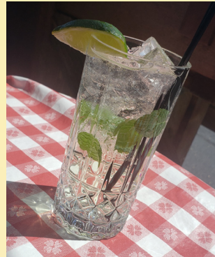
Mojito - 7

Bacardi Limon | Our housemade Mojito syrup made with mint grown on site