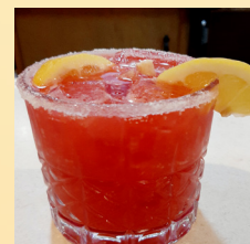
Ere'beere Lemonade - 7

Vodka | house-made Strawberry Purée | Lemonade