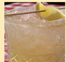
Honeybee Lemonade - 8

Our house-made Rhubarb and Strawberry Purées | Jose Cuervo Gold Tequila | Triple Sec | Lime Juice